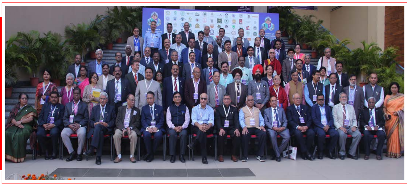
93^{rd} Annual General Meet and National Seminar on Autonomy for Excellence in Higher Education organized by Association of Indian Universities on 16^{th} - 18^{th} February 2019