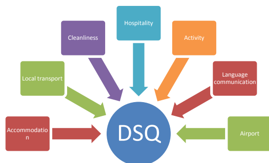
Figure 1: Destination Service Quality Components

The notion of the DSQ was a component of the ‘parental’ service quality concept that was used in many marketing studies [17]. Generally, it is regarded as the perception of the service quality that is experienced by the tourists during their stay which is measured based on the services that they still remember after they have returned to their hometown [30]. Thus, it refers to the measurement of the performance of the services which are consumed by the tourist at their destination. It must be noted that some studies use the concepts of the natural quality of the destination and DSQ, interchangeably. Also, the components of the destination and the destination quality are often used as substitutes for one another [24], [30], [31]. Thus, it was seen that the properties and the service quality of a destination are interconnected [28]. Furthermore, the destination quality is further subdivided into DSQ and the destination natural quality [24]. This study used the 7 DSQ components described by Tosun, Dedeoğlu & Fyall [17], i.e., the accommodation, Cleanliness, Local transport, Hospitality, Language communication, Activity and Airport services.