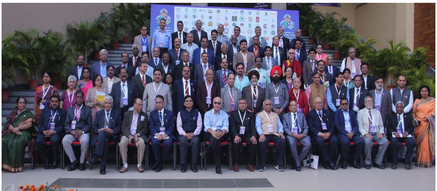
93 rd Annual General Meet and National Seminar on Autonomy for Excellence in Higher Education organized by Association of Indian Universities on 16 th – 18 th February 2019